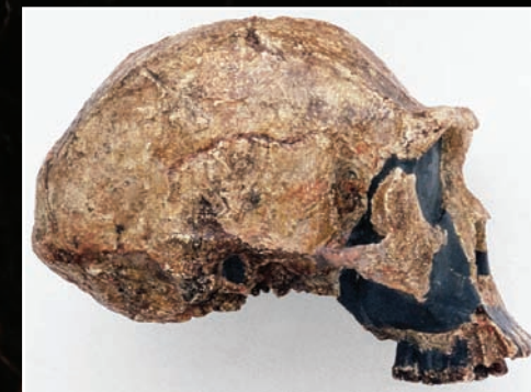
A typical "Homo Erectus" Skull

For more technical details concerning the actual fossil finds see Martin Lubenow's lifelong study of the subject: "The Bones of Contention: A Creationist Assessment of Human Fossils"