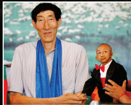
July 13, 2007 - The tallest Chinese human (7'8") with the smallest (2'5")

Various forms of these bones and skulls have been artistically arranged in ancestral charts for centuries. Meanwhile, new finds routinely claim to "re-write" the story of human evolution (which has become increasingly complex rather than easier to comprehend). In reality, human evolution is assumed to be a fact and the fossil fragments are simply lined up to support this belief.